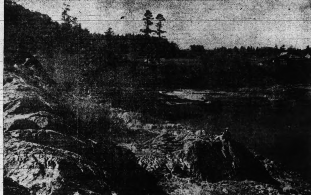
SHOAL BAY-ALONG THE MARINE DRIVE.

available to put it into condition, and $25,000, and possibly more, will be spent on it. Inasmuch as practice is to start about September 7, the course will have to be ready and olled by that